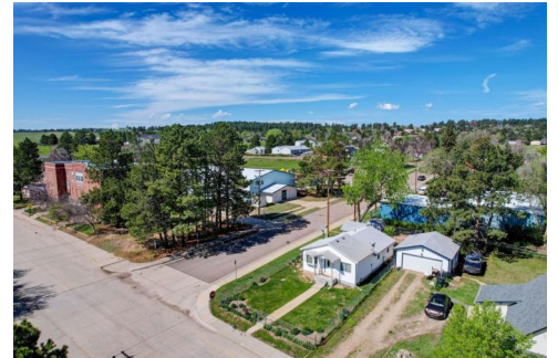
481 South Banner Street, Elizabeth, CO 80107 - 2, 481-south-banner-street-elizabeth-elbert-cou