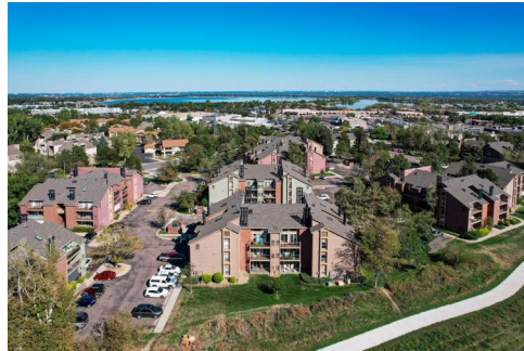
4899 S Dudley St #F20, Denver, CO 80123 - Main