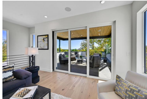
4895 West 29th Avenue, Denver, CO 80212 - All Levels