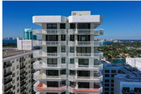
6061 Collins Avenue, 22 F, Miami, FL 33140 - all_floors_6061_collins_avenue_22f_miami_beach