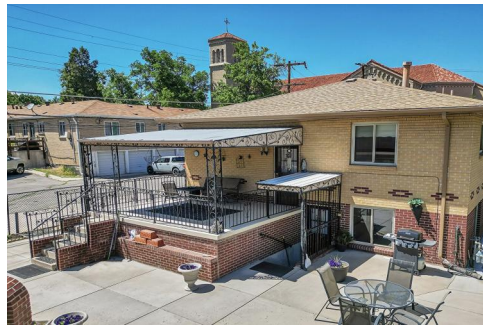
2940 W 42nd Avenue, Denver, CO 80211 - Main Level