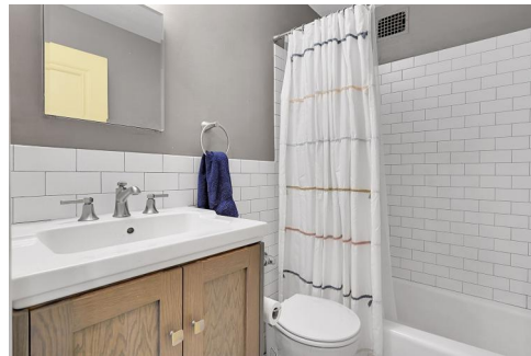
1050 N Washington Street, Unit 103, Denver, CO 80203 - all_floors_1050_washington_street_103