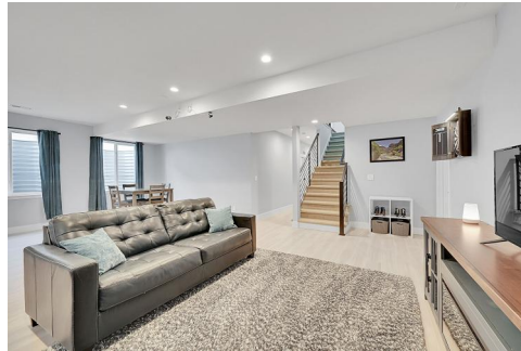
9266 Glitter Way, Colorado Springs, CO 80924 - floorplan, single, 1