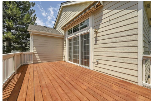
4246 East Hinsdale Circle, Centennial, CO 80122 - floorplan_single_1