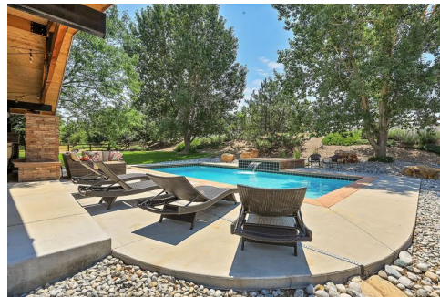
18132 East Euclid Place, Aurora, CO 80016 - upper level