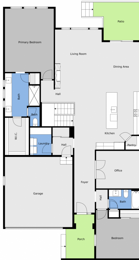
Floor Plan Created By V1photos.com, Measurements Deamed Highly Reliable, But Not Guaranteed.