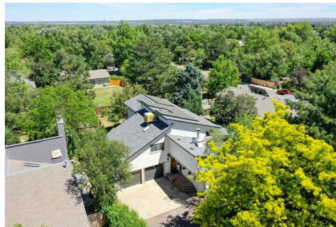
3320 15th Street, Boulder, CO 80304 - Main